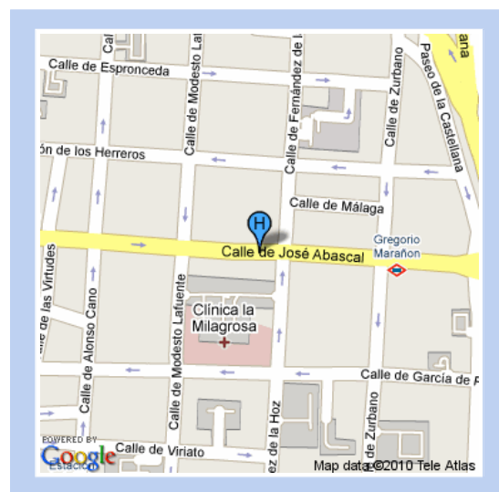
c/José Abascal 47, Madrid (Spain)

In the centre of Madrid you can find one of our most emblematic hotels: The NH Abascal, which occupies a former embassy building. The hotel has an excellent location close to the famous 'Paseo de la Castellana'. Meticulously remodelled, the hotel offers 183 rooms all beautifully designed and the latest facilities guarantee a comfortable stay.