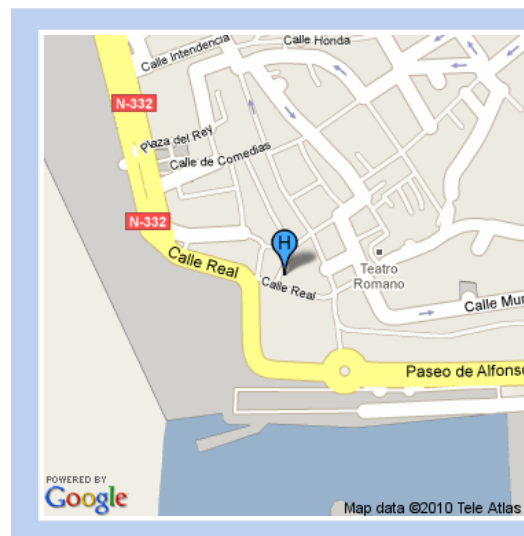
Real 2. Plza. Héroes de Cavite, Cartagena (Spain)

In the heart of Cartagena's midtown commercial and business district, next to the city hall, its excellent location is ideal for enjoying the whole of this beautiful city's personality. The NH Cartagena harmoniously blends design and the most modern equipment to ensure a comfortable stay.